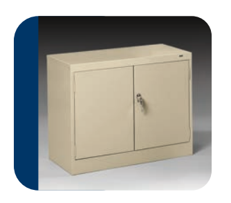
Fully Welded/Assembled Cabinets are ready for immediate use.