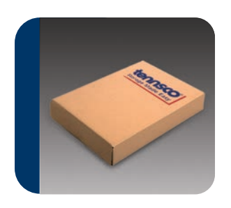
Unassembled Save on freight. Easy assembly with just a screwdriver, hammer and provided nut driver.