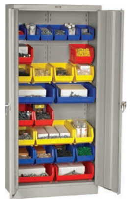
Bin boxes sold separately by other suppliers.